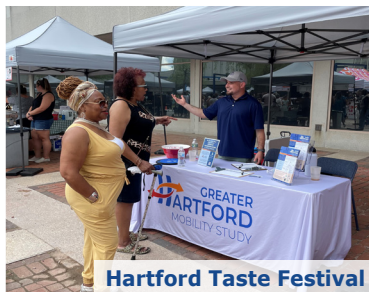
Hartford Taste Festival

"Climate preparedness is crucial! I support targeted reinforcement that improves resilience and longevity."