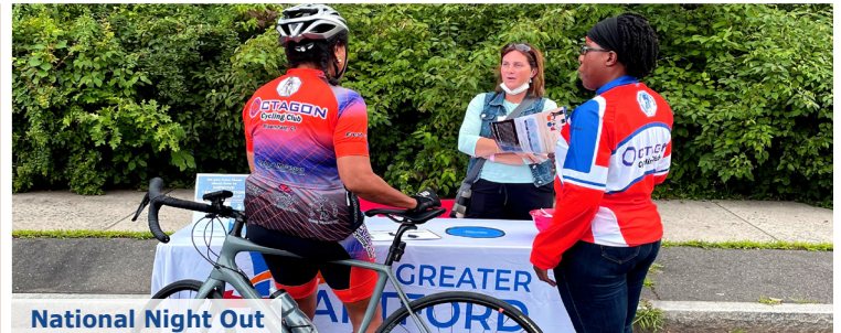
National Night Out

"Please prioritize bike infrastructure that caters to all trips regardless of purpose instead of recreation-only."