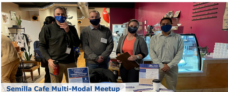
Semilla Cafe Multi-Modal Meetup

"I favor BRT improvements and small roundabouts for traffic calming, not widening of existing roads."