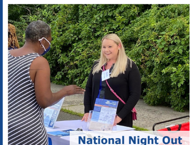
National Night Out